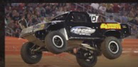
STADIUM SUPER TRUCKS