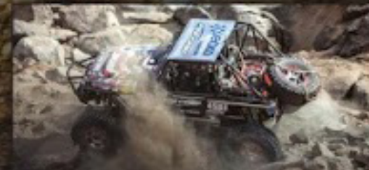
ULTRA4 KING OF THE HAMMERS

Photo spread: Greg Adler in his Lucas Off Road Series Pro 4