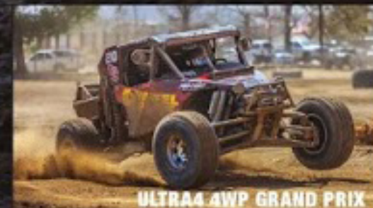
ULTRA4 4WP GRAND PRIX