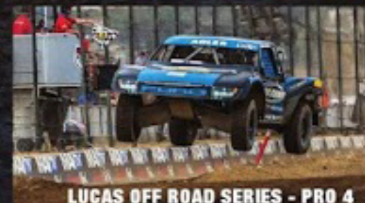
LUCAS OFF ROAD SERIES - PRO 4